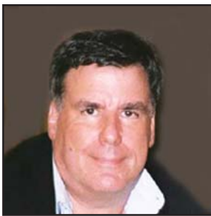
“Q & A by International Bridge Star”